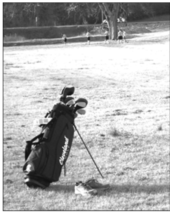
Above Cadets collect balls after working on their drives during golf practice. Top The tennis team practices serving at the base line.